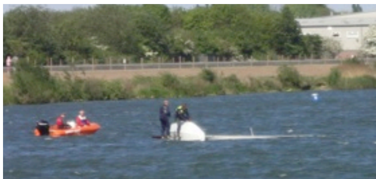
Pursuit race photos from Sunday 1 May