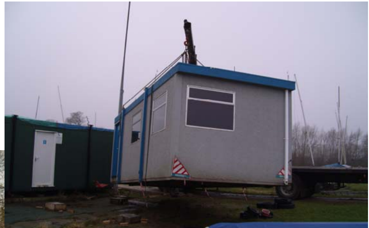
The new men's changing rooms take shape (above and top left)